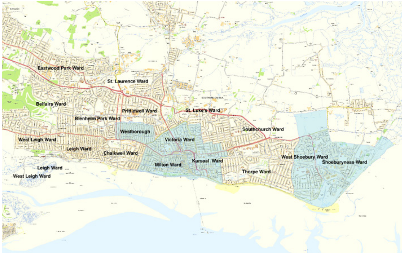
Figure 1 : Map of Southend

It has a population of approximately 175,000 people. 23.7% of the population of Southend-on-Sea is under the age of twenty.